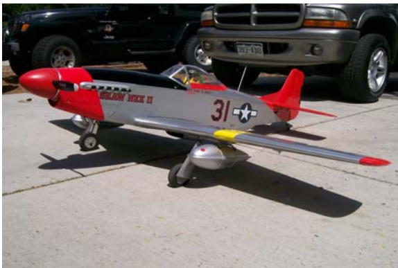
Keith Davis' 80" WS P-51 Mustang

The pictures that you see below, and any future pictures that are submitted, will be cut out of the newsletters and put into a box for the random drawing in December.