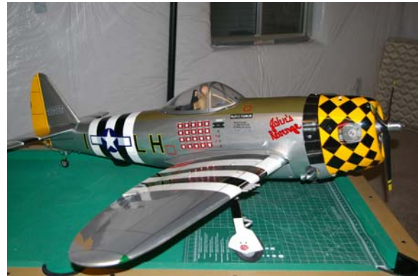
Daryl Lloyd's 70" WS P-47 Thunderbolt